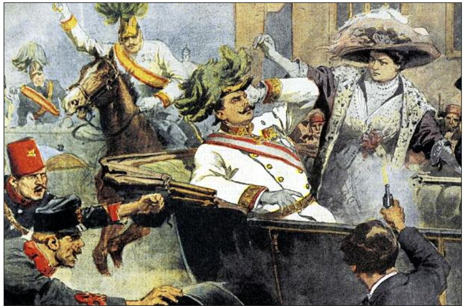
The assassination of Archduke Ferdinand and his wife, Sophie, as depicted in a drawing on the front page of a 1914 Italian newspaper.

The brief Franco-Prussian War, which ended in 1871, led to a shift in Europe's balance of power. Prussia, along with other German states, quickly defeated France. The German states formally united as the nation of Germany, and Germany began to catch up to Britain