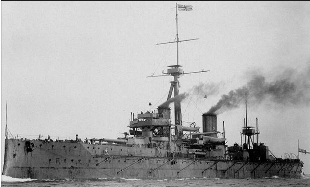
The first of its kind, the British navy's powerful Dreadnought became the standard for battleships of the era.

whether France's actions in Morocco had violated an international treaty. A conference took place the next year in the Spanish town of Algeciras to discuss issues of international law in the African colonies. But the outcome was not particularly positive for Germany, because Britain voted with France, as did Italy, and only Austria backed the kaiser.