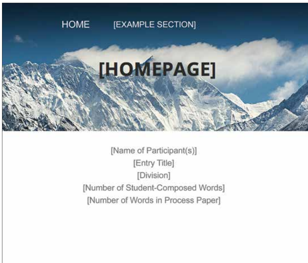
FIGURE 8 | SAMPLE WEBSITE HOME PAGE