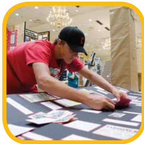
FIGURE 4 | EXHIBIT SIZE LIMIT ILLUSTRATION