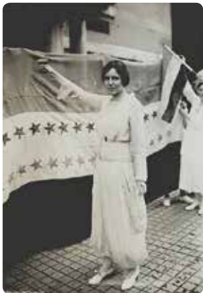
Alice Paul, 1918

Alice Paul was responsible for the campaign for women’s suffrage and the introduction of the Equal Rights Amendment.