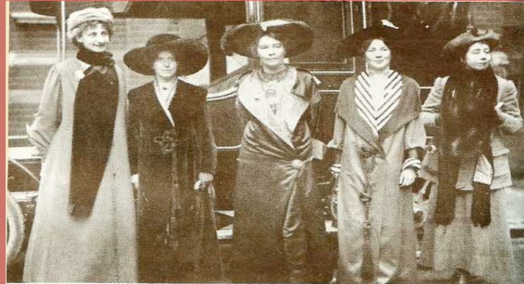
Left to right: Constance Lytton, Annie Kenney, Emmeline Pethick Lawrence, Christabel Pankhurst and Sylvia Pankhurst